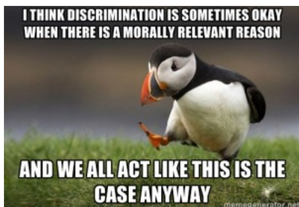
Unpopular opinion puffin.

Absolutely. Equality is a boon in our days. It is great that to believe in progress is to believe in equality. This is a remarkable improvement upon the early 20th century, when progress, many thought, depended on recognising the fundamental “inequality” of humans through eugenics. That equality gets so much air-time is reassuring in the face of other more sinister moral principles that we see creeping into society. The problem comes when a belief in the equal worth of all human beings extends to a belief that discrimination – in the strict sense of the word – is always wrong.